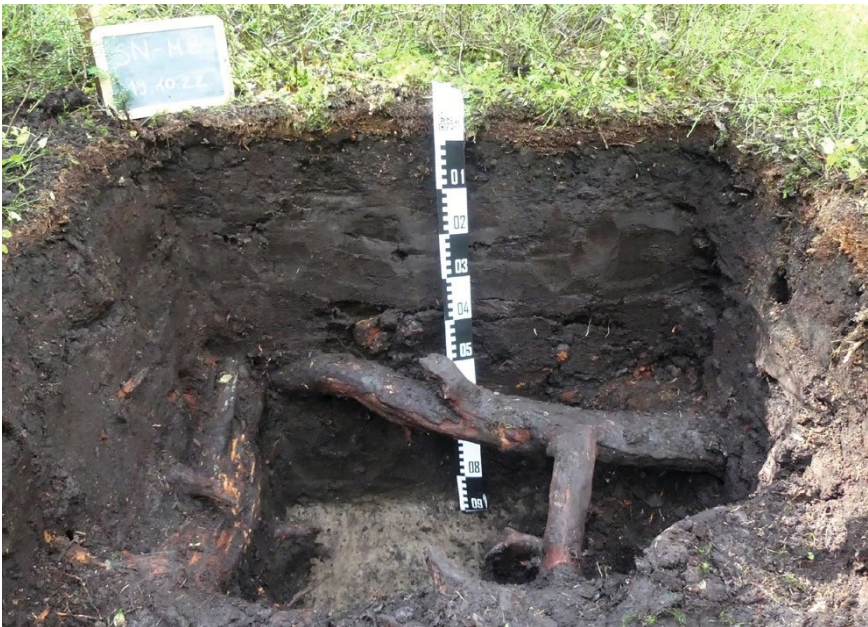
Figure 7 Drained Histosol (Sapric Murshic Histosol (Dystric)) with tree-root remains in the Ore Mountains.

The proportion of Histosols (i.e., peat soils) and other humus-rich wet soils in the soil cover under forest is approximately 2.4 %. The major part of the peatland and wet soils has been subject to artificial drainage. Even though Histosols make up only a small area, they act as an important carbon storage, and as a relevant CO 2 source in case of drainage. Their rewetting offers potential for climate-change mitigation and biodiversity conservation.