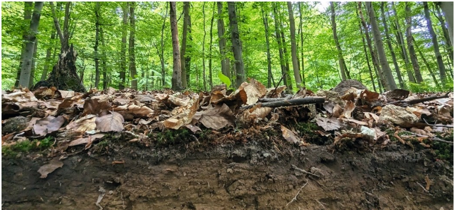
Figure 8 The forest floor and intensively rooted topsoil: the place where organic matter is transformed, most of the soil organisms live and where nutrients are recycled.

The National Forest Soil Inventory (NFSI) provides information about the current state and the changes of our forest soils. For this purpose, soil, forest-stand and vegetation data are collected on 8 km x 8 km grids at 1,900 sites across Germany. The NFSI takes place approximately every 15 years. The field assessments of the third NFSI are currently in progress.