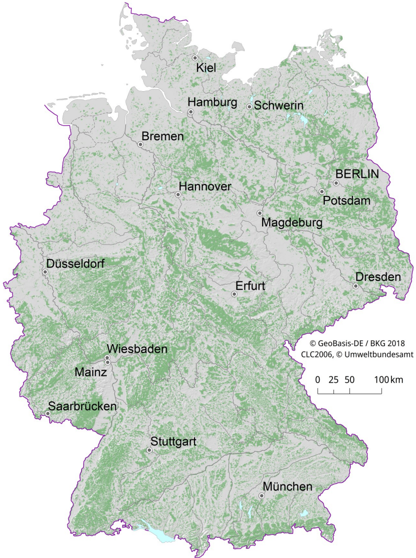
Figure 1 Forest covered area of Germany.

Almost one third of the area of Germany (11.4 million hectares) is covered by forest. Thus, forest soils play an important role in our landscape, providing fundamental functions and ecosystem services to forests and their water and nutrient cycles.