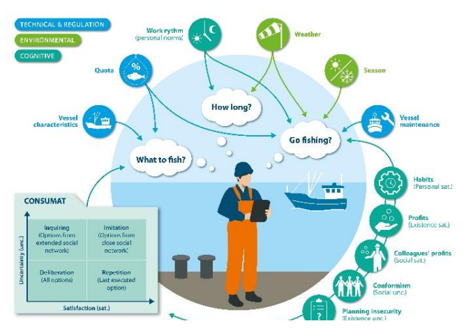
Fig. 2: Factors influencing the decision-making process of fishermen taken into account by the agent-based model.

On the other hand, the introduction of hard substrate creates new habitats that offer refuge opportunities for potential new fishery resources, such as edible crabs (Cancer pagurus). Results show that a passive gear fishery targeting edible crab around existing and planned OWFs could be economically viable in the summer months.